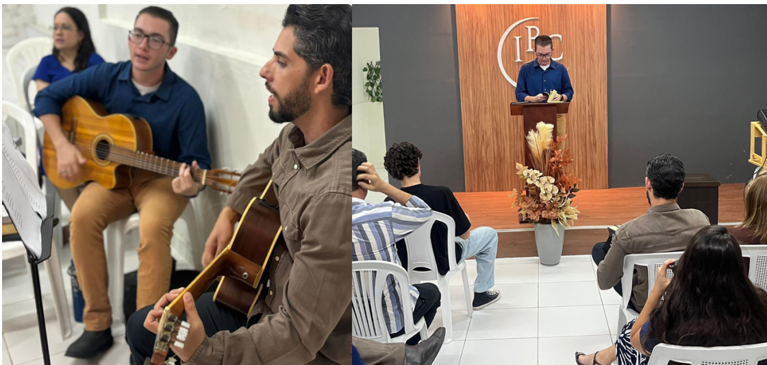
Visit to one of CTMBC's supporting churches in Brazil

World Wide New Testament Baptist Missions has very graciously allowed me to remain with them as an associate missionary while I try to sort out my ticket back to the States. They have been truly faithful in their service over the past two years and will continue to be so as God leads the way to my next step.